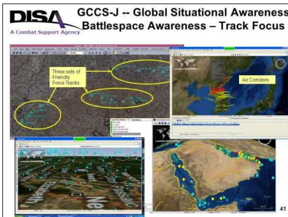
Developing Comprehensive Net-Centric Operations and Predictive Capabilities