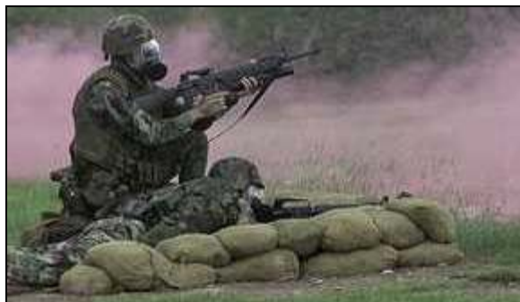
Fighting Battlefield Obscurants with Technology