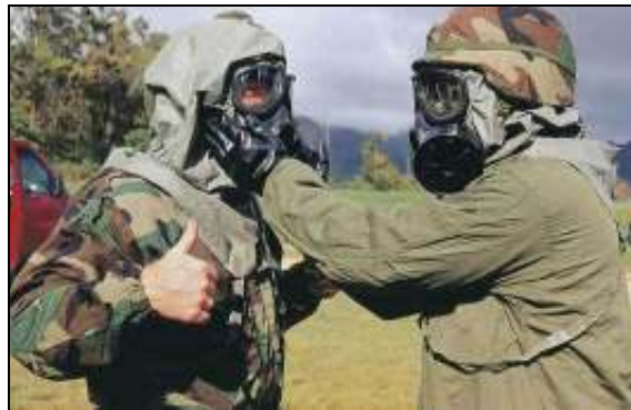
U.S. troops mask up in preparation for a chemical/biological agent attack.

sensors in an affordable and efficient manner and defeat target acquisition devices, missile guidance, and directed energy weapons, all of which can operate from the visible spectrum through the microwave portion of the electromagnetic spectrum. Notably, the dissemination systems incorporated into these materials will be designed to be safe and environmentally acceptable.