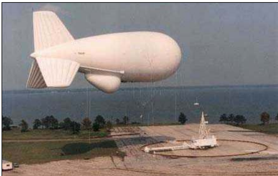
The JLENS consists of an aerostat equipped with advanced radar systems.

The JLENS Spiral 3 system measures up to 70 meters (230 ft) and carries its payload at altitudes up to 15,000 feet. Like the Spiral 2, a single Spiral 3 aerostat carries both precision track and surveillance radars. The U.S. Army reports that the Spiral 3 is untethered. The Spiral 3 would provide the Army and joint forces with the ability to employ interceptor weapons against sophisticated cruise missile and aircraft threats at long ranges.