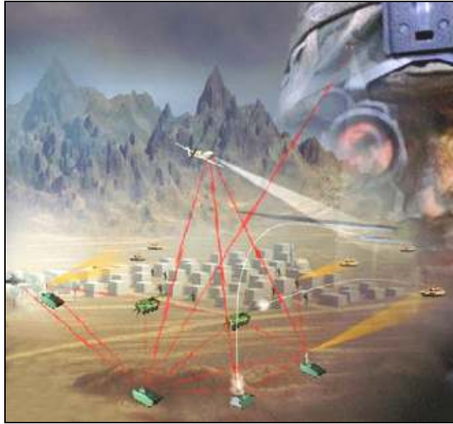
Managing Battlefield Information for Quick Decision Making.