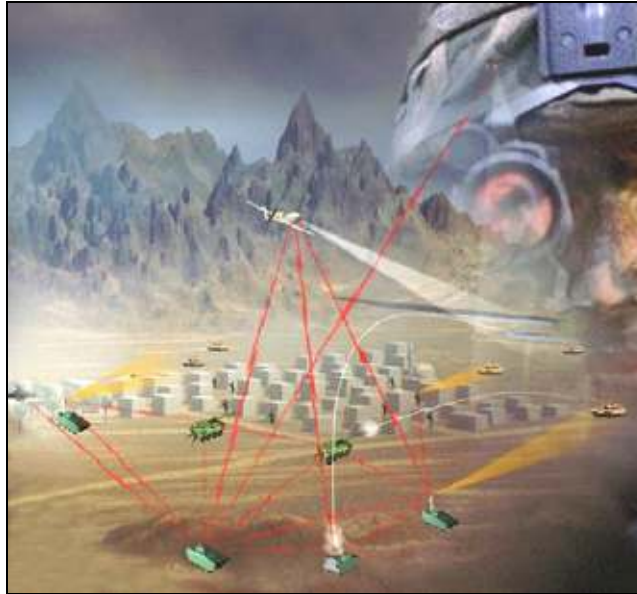
Managing Battlefield Information for Quick Decision Making.