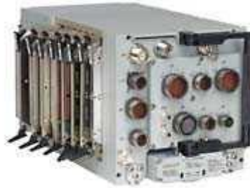
Link 16 MIDS Tactical Data Link Terminal Made by ViaSat

MIDS-JTRS or MIDS-J. Upgraded version of MIDS that is compatible with Joint Tactical Radio system (JTRS) waveforms. The four-channel MIDS-J will initially run Link 16 and TACAN and additional waveforms will be added later.