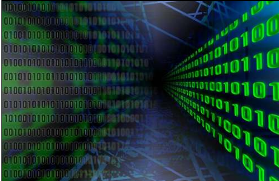
Information Decision Making Technology is a project of the U.S. Air Force.

need for re-planning across a degraded operational environment to be determined. In FY19, this subproject will initiate research and development of multi-domain command and control technologies. Also, it will seek to determine how to apply machine learning techniques to enhance and optimize space operations.