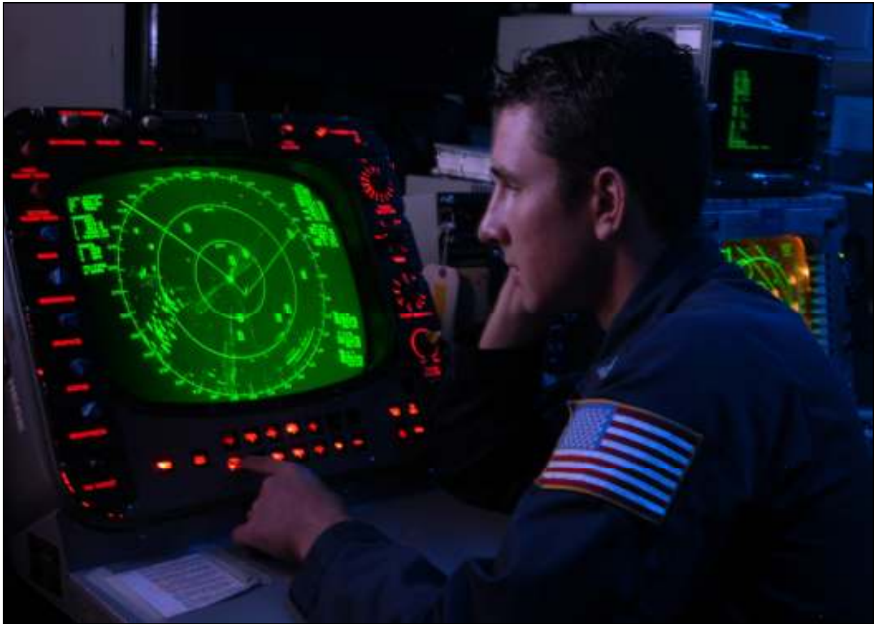
A U.S. Navy Sailor examines an SPS-67 radar readout screen.

Long- and medium-pulse (1 \mu s and 0.25 \mu s) modes are available for use in open sea for the detection of long- and medium-range targets. An interference suppressor and digital video clutter suppressor are used to improve performance.