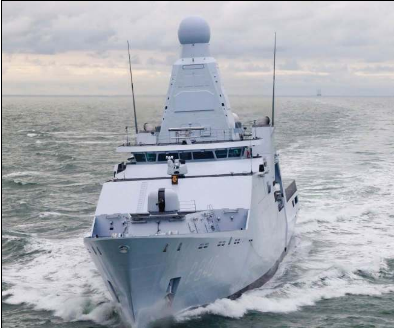
IM400 Integrated Mast on a Royal Dutch Navy Holland Class Patrol Vessel