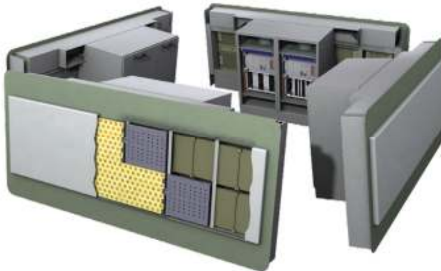
The Active Phased Arrays of the IM400's SMILE/Sea Master 400 Long-Range Surveillance Radar