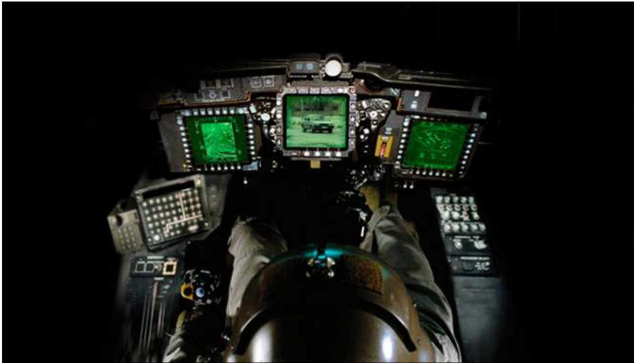
Lockheed Martin produces the VUIT-2 system.

The VUIT-2 system can be installed in the field using a Tri-band Omni-directional Mast Mounted Assembly (TOMMA) sensor, a Right EFAB Chassis Video Receiver (RCVR), and a VUIT Mini-TCDL (tactical datalink) for simultaneous display by soldiers equipped with an OSRVT or another ground terminal/station.