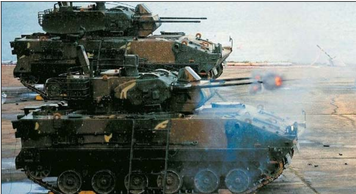
K30 Bi Ho Self-Propelled Anti-Aircraft Gun System

The EO tracking system can search out to 7 kilometers (7,655 yd) and track targets out to 6 kilometers (6,561 yd). The system can operate in four modes: automatic, semi-automatic, periscopic, and ground engagement.