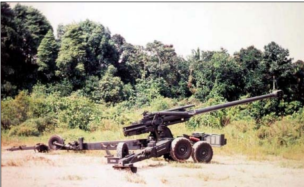
155mm FH 2000 Howitzer