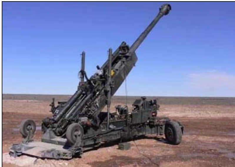
155mm SLWH Pegasus