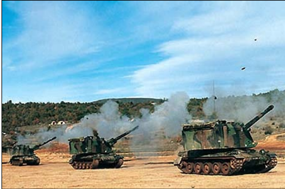
AU-F1 (155 GCT) 155mm Self-Propelled Howitzers on the Firing Line