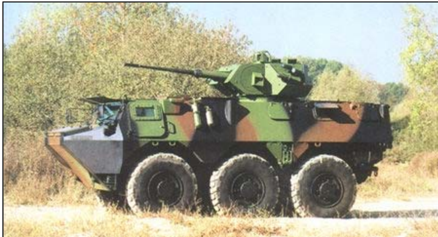
Véhicule de l'Avant Blindé

Modernization and Retrofit Overview. None at this time. The only program Nexter is currently planning would retrofit older VAB vehicles to the VAB Improved standard.