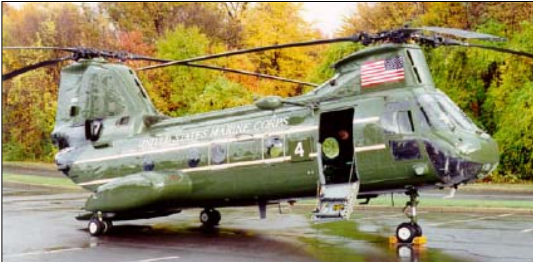
CH-46 Sea Knight