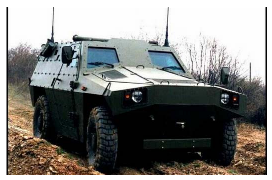
Alligator Patrol Vehicle

Modernization and Retrofit Overview. Not applicable at this time. Modernization and retrofit potential may develop in the long term of the forecast period.