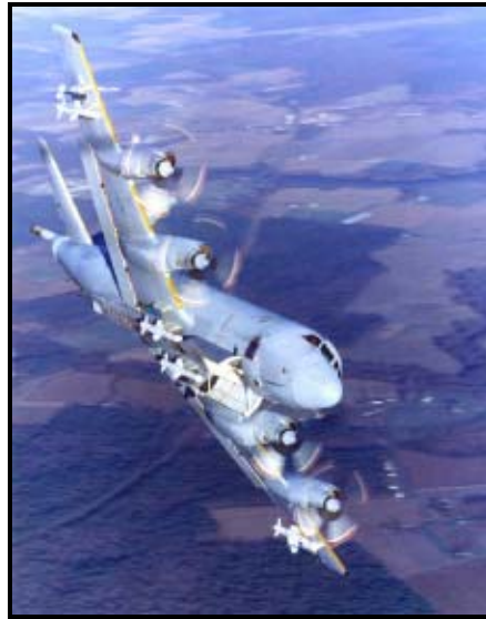
Lockheed-Martin P-3C Orion maritime patrol aircraft of US Navy is an AQA-7(V)-equipped ASW platform

The ASA-76 CASS signal generator is an airborne signal source and control element for command active sonobuoys also manufactured by Hughes (formerly Magnavox). It works in conjunction with the AQA-7(V) and is used to search for, detect, locate, and identify submarines at short ranges.