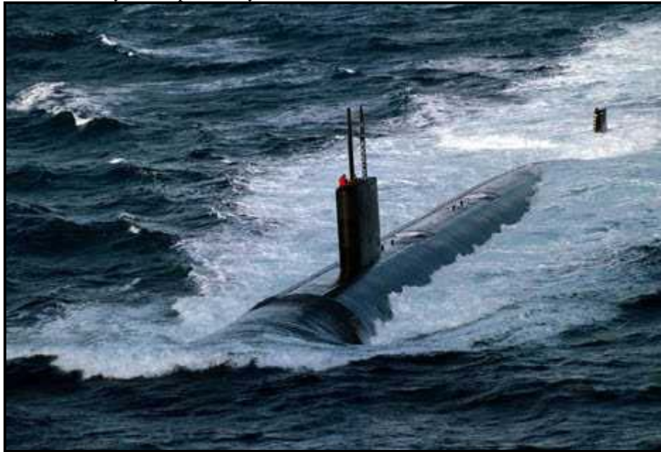
USS Columbia (SSN-771) is a U.S. Navy Los Angeles class submarine. This class is the primary platform installation for the BQN-17A

separately. This system reportedly incorporates major portions of BQN-17(V) technology. The SSN-21 Seawolf class submarines have a different depth sounder/fathometer.