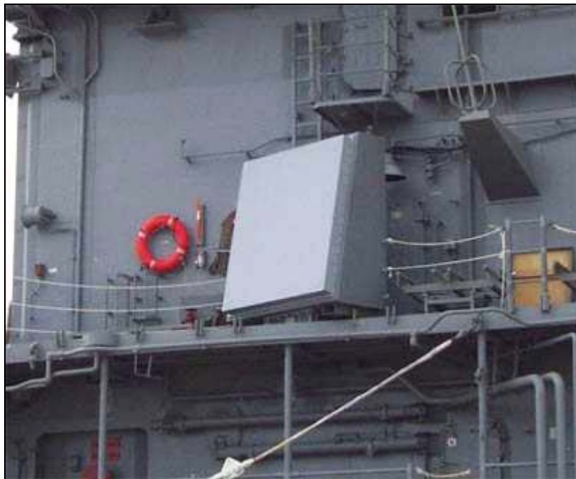
SLY-2(V) prototype antenna

The system would have been designed for future growth in order to adapt quickly to changes in the threat environment. Flexibility would have been supported by the use of common interfaces, modular architecture, a scaleable network, and external gateways. The system would have had low life-cycle costs and been adaptable to different platforms, an important budgetary consideration.