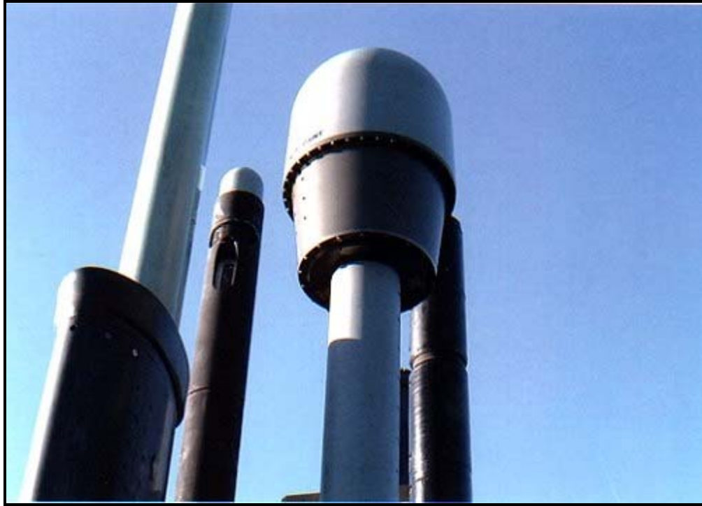
Extremely Low Frequency (ELF) submarine communications. The SubHDR Antenna Installation on USS PROVIDENCE (SSN 719). The current periscope mounted system is just to the left of the larger SubHDR antenna

frequency several times per second, with each shift representing one data bit. However, messages still need to be repeated in order to ensure that they can be heard above magnetic storm interference.