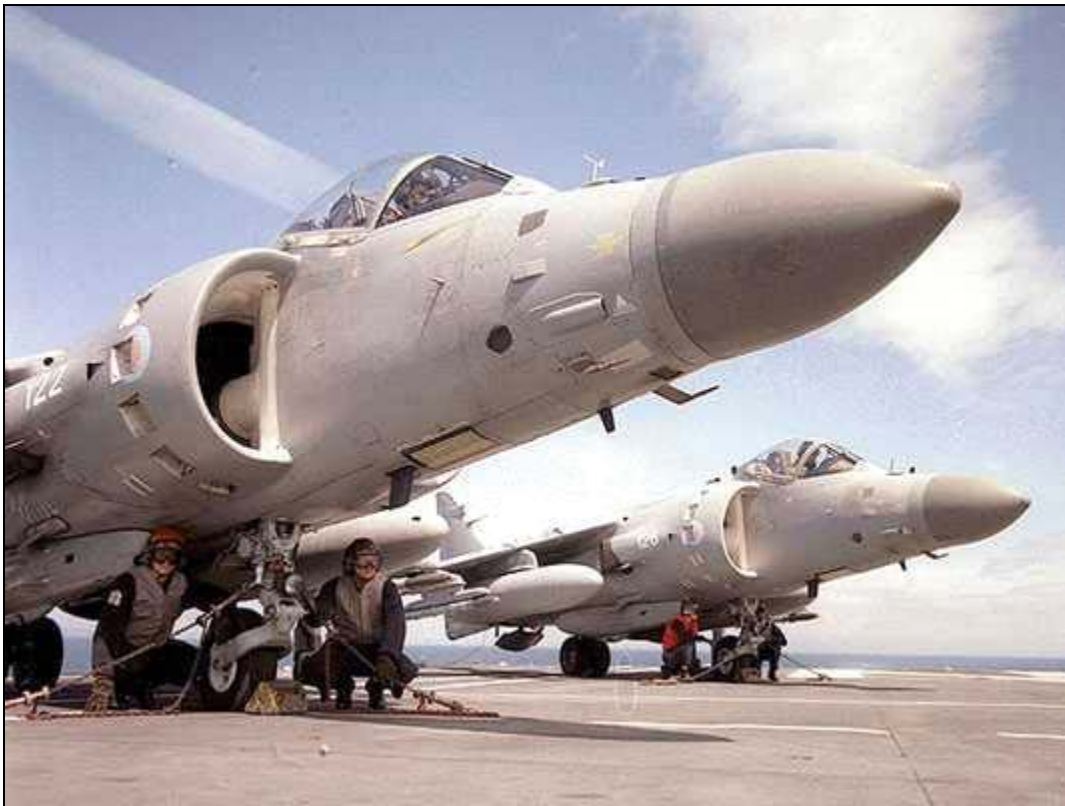
UK Royal Air Force Sea Harriers

Operational Characteristics. In the air-to-air mode, Blue Vixen provides look-up, look-down, track-while-scan, and single-target-track capabilities. It operates effectively over sea and land and in all weather. Because the platform is a single-seat aircraft, Blue Vixen features head-up combat modes and is fully compatible with both infrared (IR) and radar missiles.