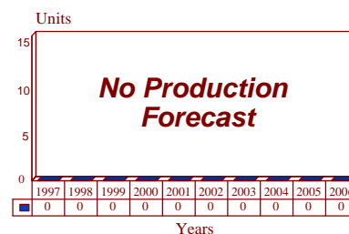
10 Year Unit Production Forecast 1997 - 2006