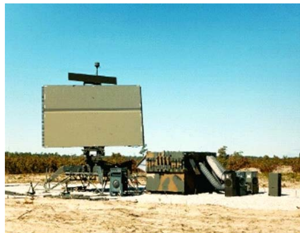
TPS-75(V) Battlefield Radar