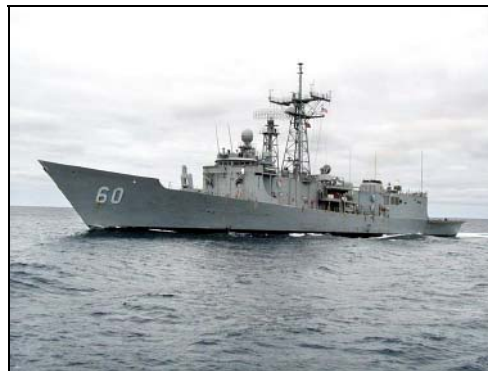
The Oliver Hazard Perry class guided missile frigate USS Rodney M. Davis (FFG 60) is one of the many warship platforms operating the SQR-19 TACTAS for ASW missions