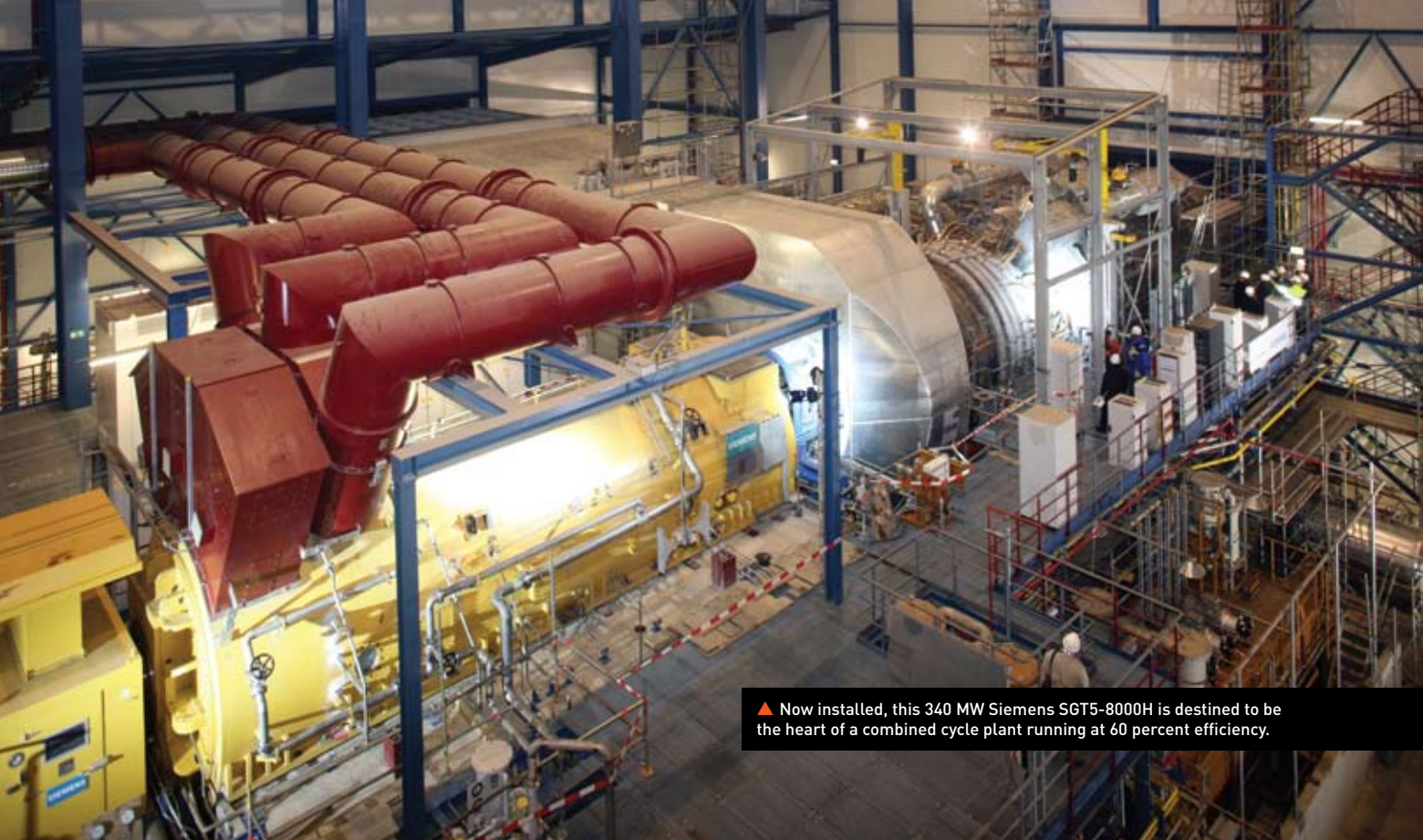
▲ Now installed, this 340 MW Siemens SGT5-8000H is destined to be the heart of a combined cycle plant running at 60 percent efficiency.

input to the gas turbines in the combined cycle plant. This year GE Energy announced it will be providing IGCC equipment for power plants in Edwardsport, Ind., and in Hatfield, South Yorkshire, in the U.K.