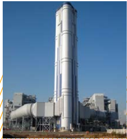
◀ Three Mitsubishi combined cycle plants, far left, generate 1,500 MW at an efficiency of 59 percent and occupy one-third of the land needed by the 40-year-old, 1,050 MW steam plant they replace. One of the new plants is shown in the center photo. The three exhaust through a single stack.

Topical Meeting on High Temperature Reactor Technology, held in Washington, D.C. The meeting, with 500 attendees, was a forum on new gas-cooled nuclear reactors designed to provide energy to heat helium gas to drive closed-cycle electric power gas turbines. Companies involved in the design and development of HTR power plants include Pebble Bed Modular Reactor (Pty.) Ltd. (PBMR) of South Africa, General Atomics of the United States, and Areva of France. South Africa's PBMR remains the clear leader to complete the first nuclear-powered gas turbine power plant; the company is scheduled to have a 165 MW pilot plant in operation and test at Koeberg, near Cape Town, in 2013. (See "Pebbles Make Waves," February 2008, for a history and description of the PBMR power plant).