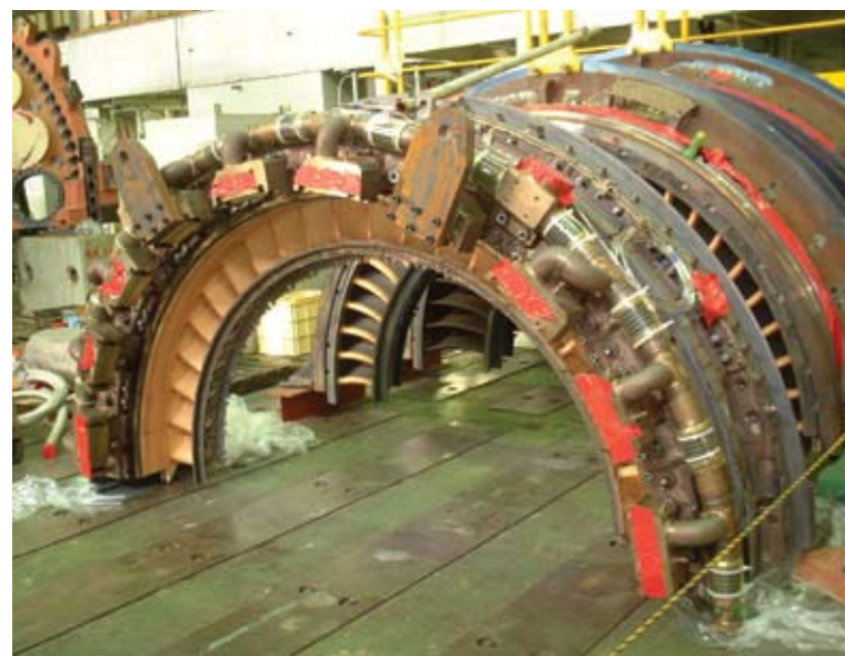
▼ The first stage turbine stator blade ring in Mitsubishi's combined cycle M701G2 334 MW gas turbine is steam cooled to control blade tip clearances under varying load conditions.

for nine years. The SGT5-8000H is rated at 340 MW, making it the world's largest, and is undergoing testing and producing power for Germany's grid at Irsching, Bavaria. The air-cooled turbine is slated to be part of a combined cycle plant output of 530 MW and Siemens is predicting a plant efficiency greater than 60 percent.