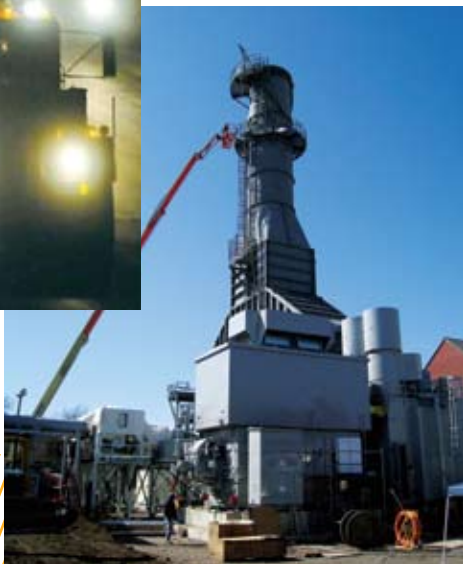
WATERBURY GENERATION, LLC