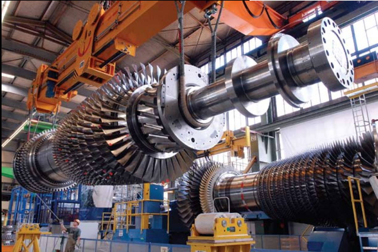
▲ Technicians prepare the Siemens Energy SGT5-8000H for delivery to a power plant in Irsching, Bavaria. The turbine weighs 440 metric tons.