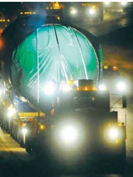
▼ The 100-metric ton intercooler for an LMS100 made a slow journey to a site in Waterbury, Conn. It is now installed as part of a plant that will produce 100 MW.

It is one thing to see an intercooler as a simple entry in a textbook, but to witness the actual hardware as it crawled down the road was awe-inspiring. It's a testament to enduring ability of gas turbine engineers to seek out ever-greater efficiency—and a massive monument to the lengths they go to achieve it. ■