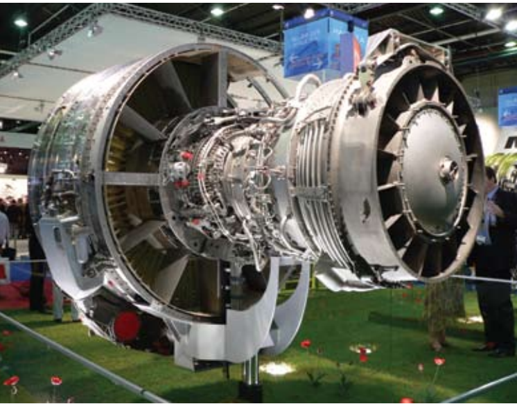
▲ First built in the 1970s, the CFM56 is a workhorse of the commercial aviation fleet, powering the Boeing 737 and Airbus A340.

The GTF significantly reduces jet engine noise and will cut fuel consumption by more than 12 percent. Designated as the PW1000G, it is currently being flight tested on an Airbus A340. The GTF will be launched on the new Mitsubishi MRJ regional jet and the Bombardier C Series narrowbody jet, but will be scaled up to thrust levels for the next generation of 737s and A320s.