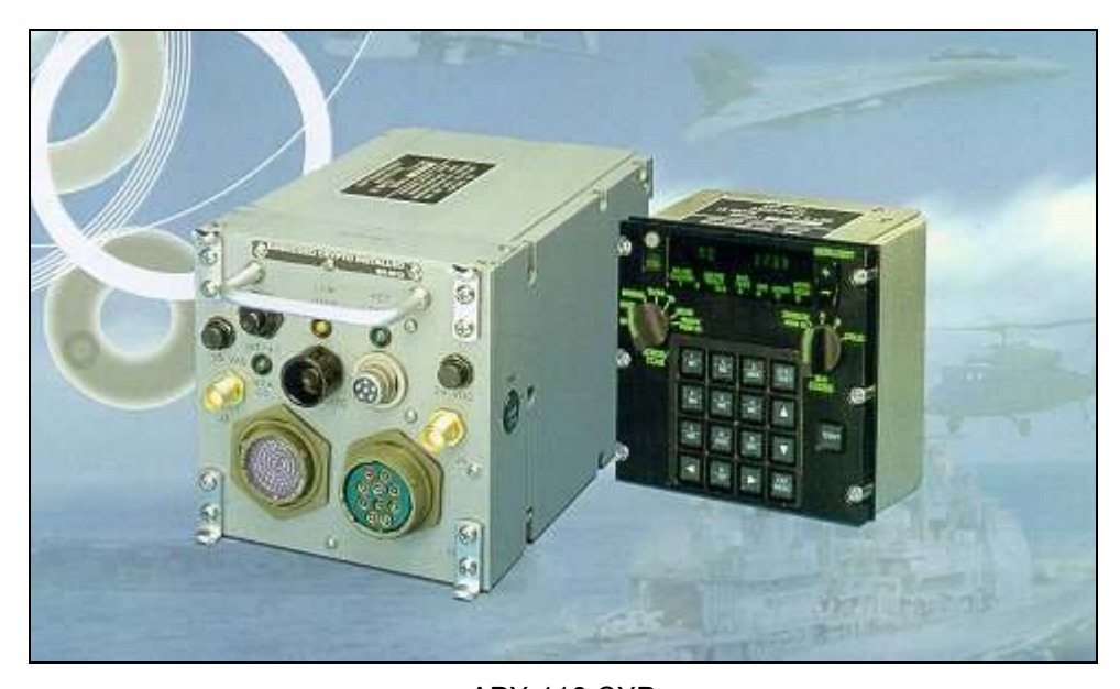
APX-118 CXP

The system was also designed for better protection of overall operation in a hostile combat environment. Electronic counter-countermeasures and crypto-coding are not needed on commercial IFF equipment. The upcoming Mode 5 will be crypto-based, and will replace the NSA-decertified Mode 4 coding scheme.