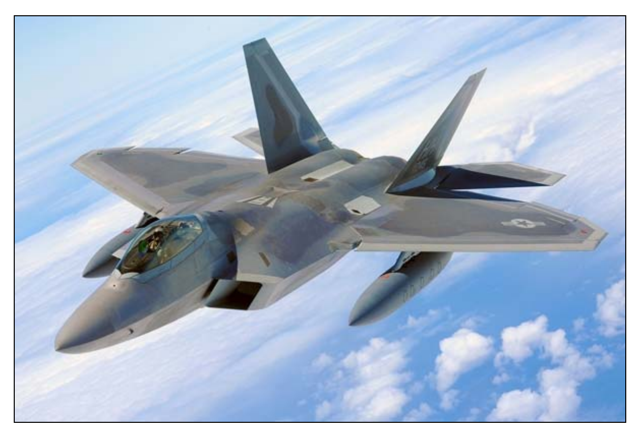
APG-77 equips the F-22 Raptor.