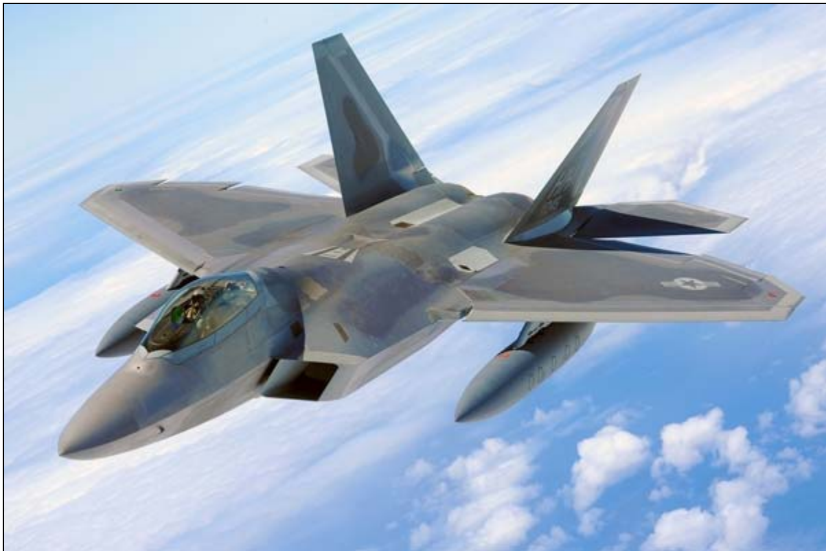
APG-77 equips the F-22 Raptor.