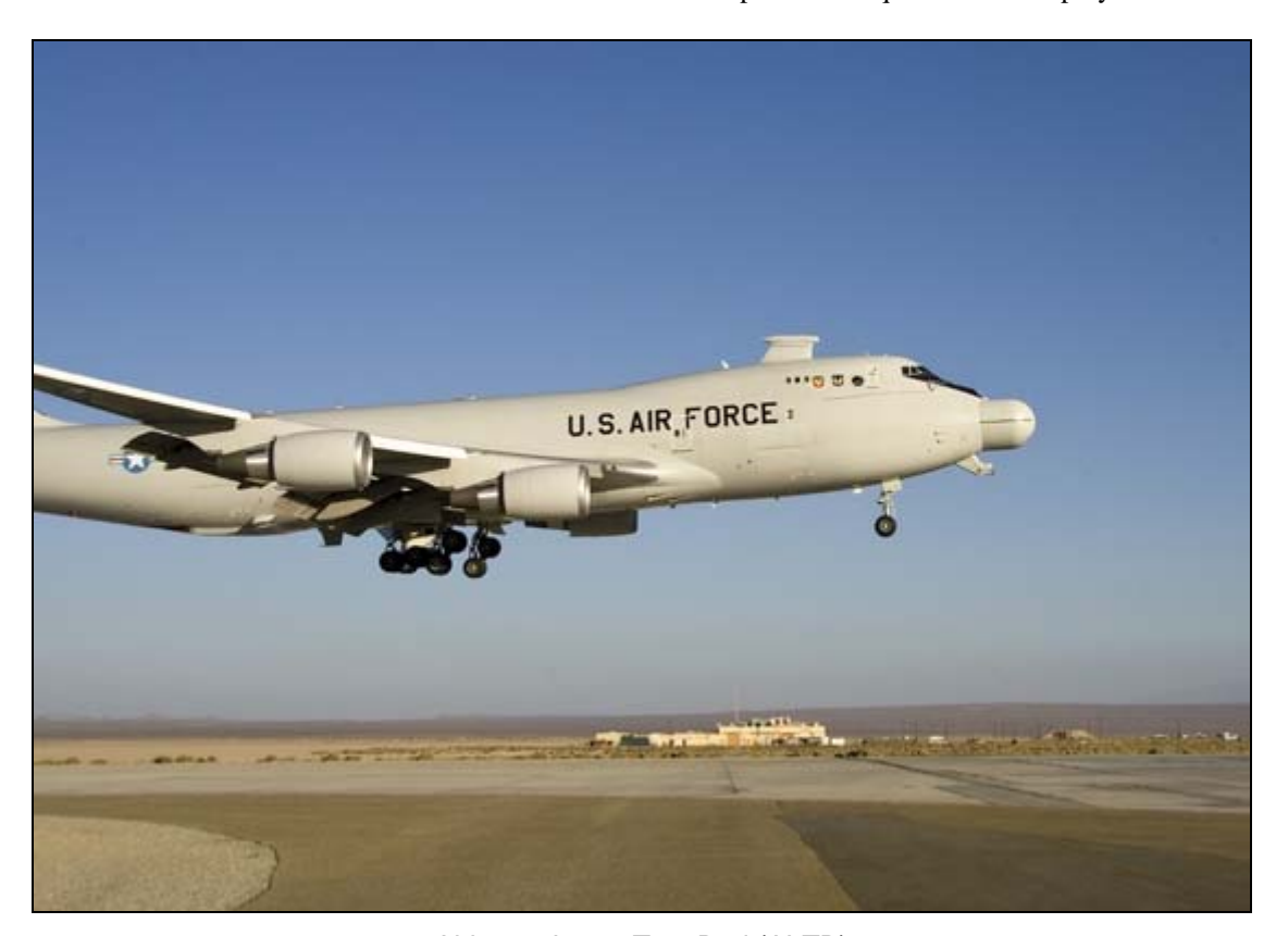
Airborne Laser Test Bed (ALTB)

Block 2010 addresses a broader range of threats and works toward integration with an overall BMDS. It focuses on the second ABL testbed, addressing performance enhancements and life-cycle cost considerations. It moves the program from design and development to acquisition and deployment.