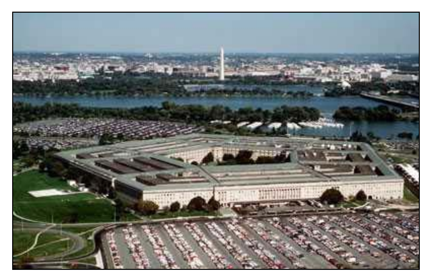
DMS is the messaging system of the U.S. DoD.

An FY12 DISA operation and maintenance budget document, dated February 2011, states that DISA's baseline review determined that the DMS infrastructure will be consolidated with other similar programs and products.