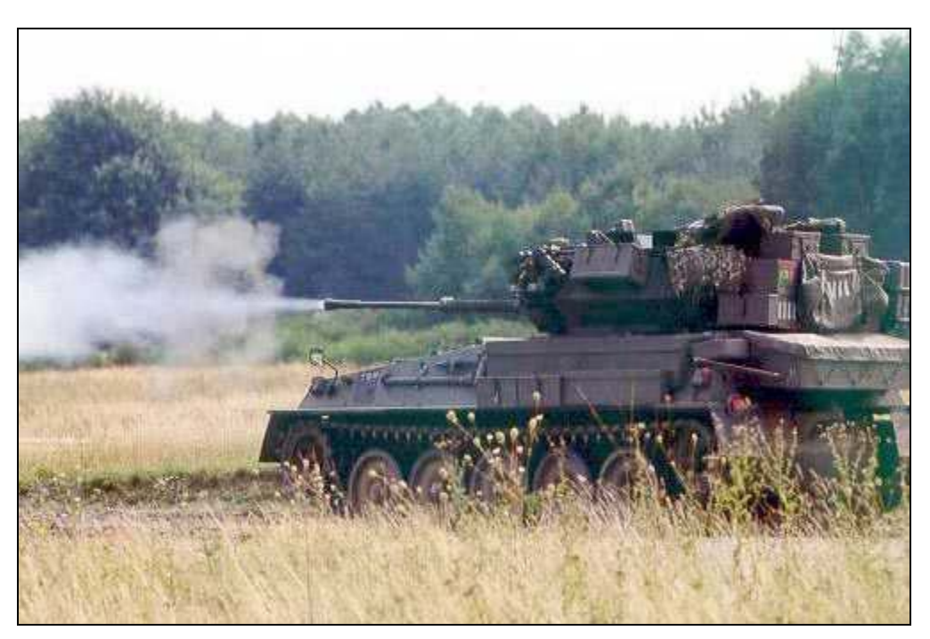
Belgian Army CVR(T) Scimitar Live-Fire Training