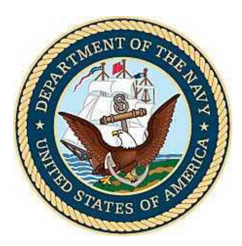
U.S. Navy Over-the-Horizon Targeting (OTH-T) Program

Coalition and joint interoperability is a key concern for future naval operations, especially given the Navy initiative to expand Internet Protocol (IP) networking throughout the U.S. Navy fleet. Currently, IP connectivity with Coalition forces is limited. Funding has been allocated for the development of solutions to IP connectivity issues in an effort to meet emerging Coalition and joint interoperability requirements.