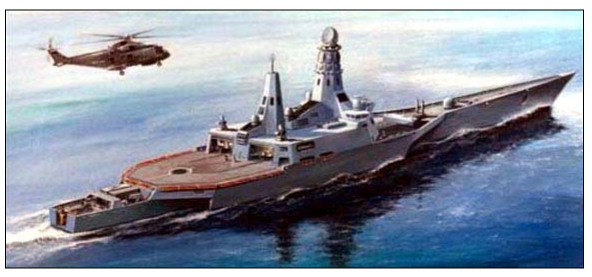
Artist's Impression of Future Surface Combatant - Trimaran Version