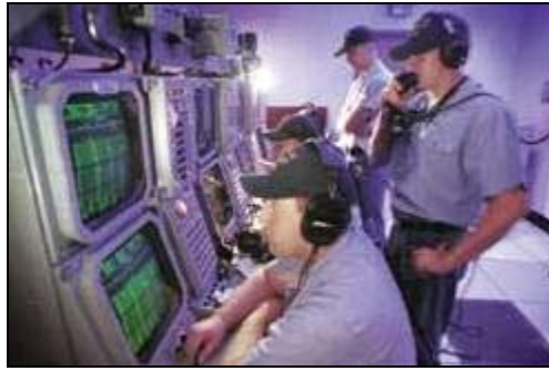
U.S. Navy BSY-1 Combat System training for Los Angeles class submarines