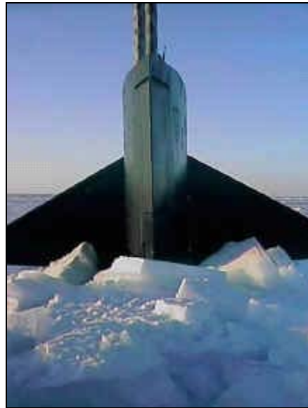
Submarine breaking through Arctic polar ice

APS is part of the U.S. Air Force's Transformational Communications Architecture.