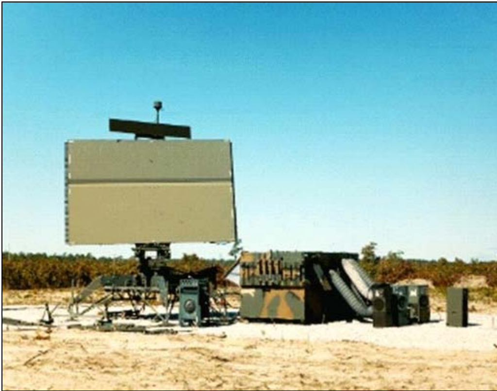
Protection for TPS-75(V)