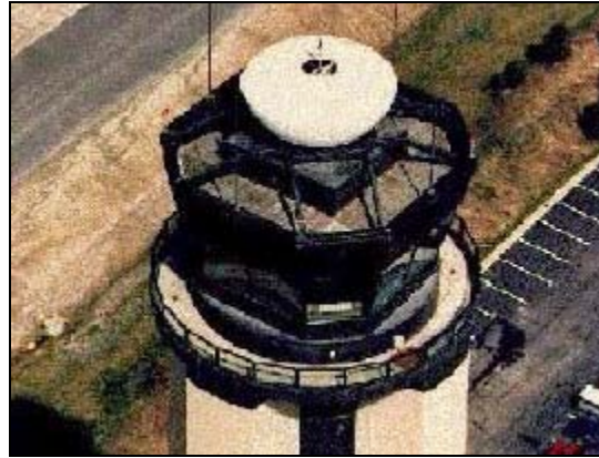
ASDE 3 Antenna