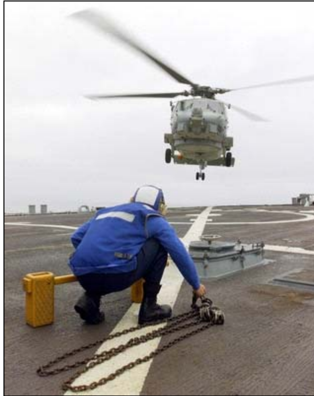
SH-60B showing APS-124(V) radar dome