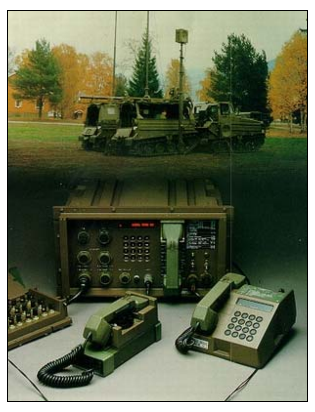
Deltamobile, tactical battlefield automatic trunk communications system