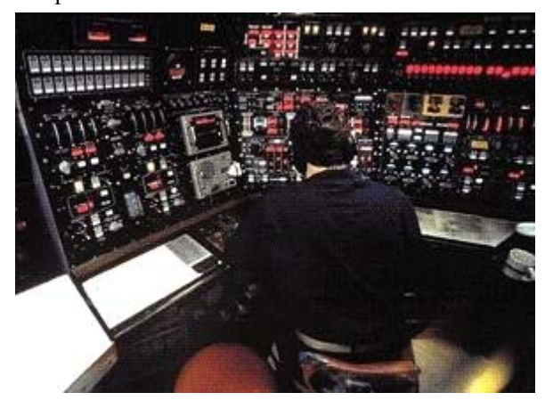
US Navy BSY-2 Advanced Combat System for Seawolf class submarines

Operational Characteristics. The development requirements for the BSY-2 included the following: develop an architecture that facilitates tactical enhancements and future growth, and provide computer processes that improve response time from initial threat detection to weapon launch. Among the characteristics of the BSY-2 that enhance Navy attack submarine capabilities are new acoustic arrays that have better detection performance and self-noise characteristics; a partitioned system architecture that facilitates tactical improvements, future growth, and high availability; computer aids to assist operators in sensor, contact, and weapon management; and finally, the employment of the most advanced submarine weapons.