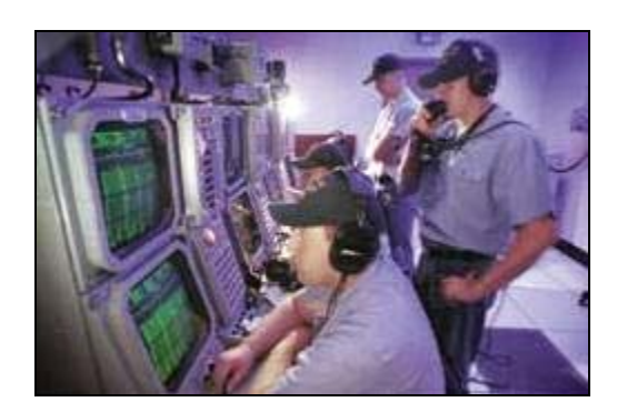
U.S. Navy BSY-1 Combat System training for Los Angeles class submarines