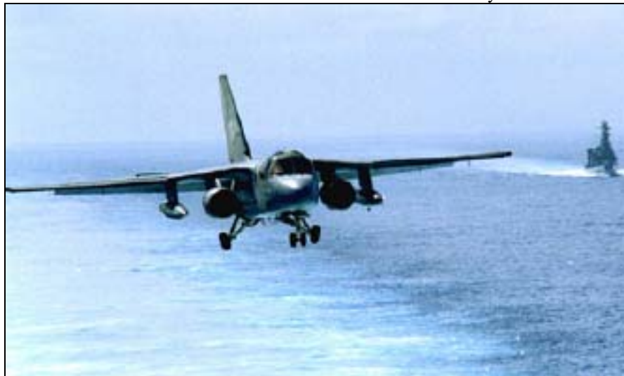
U.S. Navy S-3B Viking