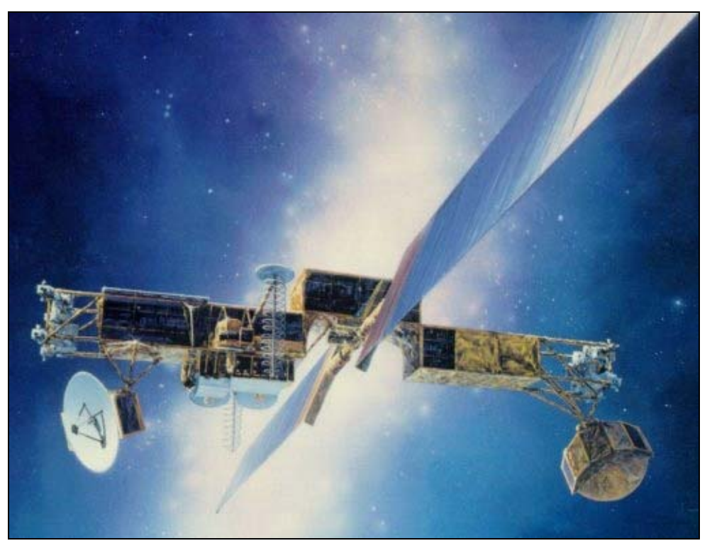
MILSTAR satellite communications system