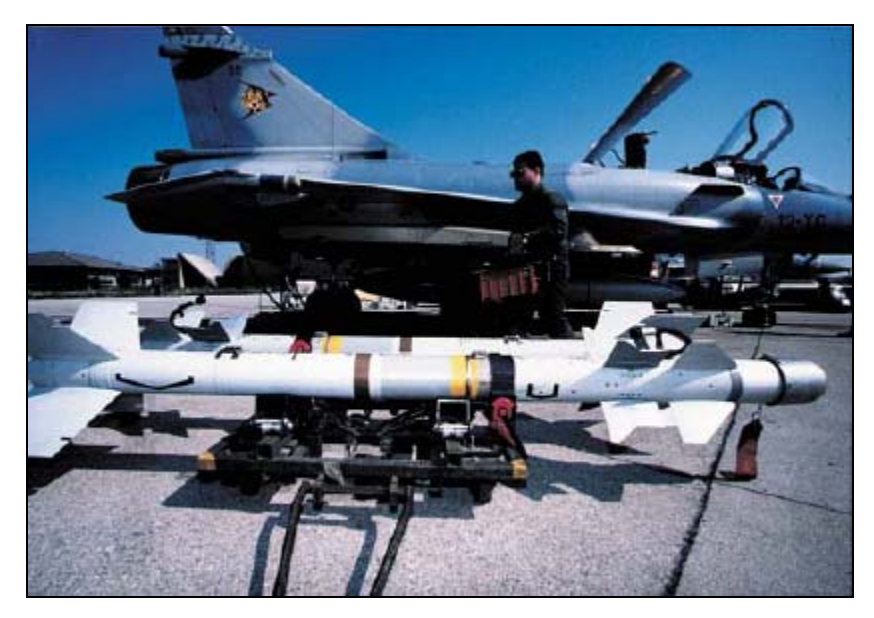
R.550 MAGIC 2

at distances greater than the range of the missile itself (about 10 kilometers), enabling a fire-first advantage over an adversary.