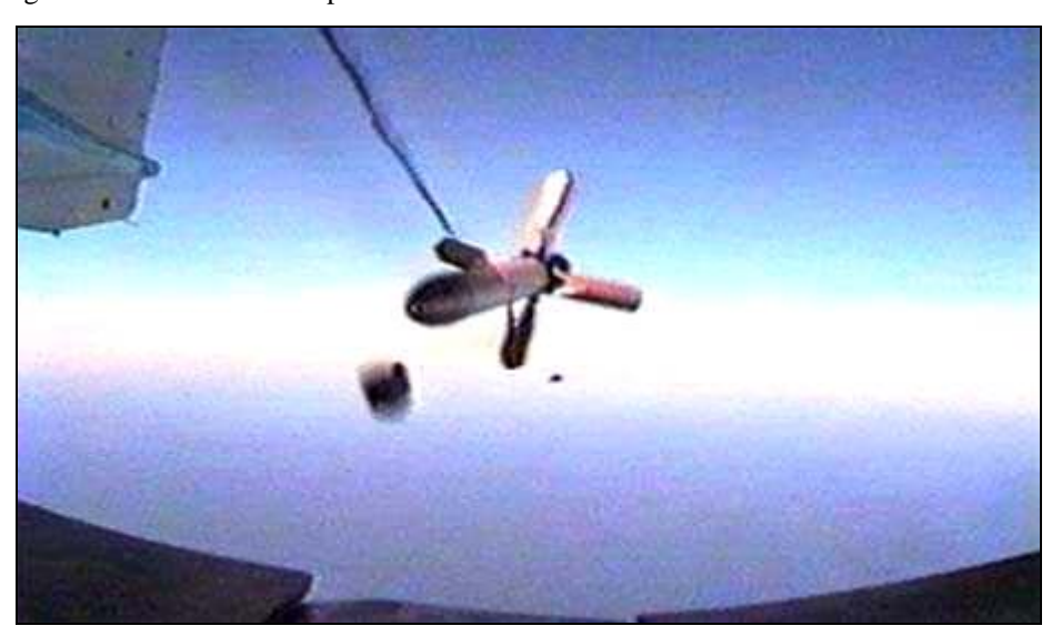
IDECM Towed Decoy

IDECM makes a missile approach warning system an integral part of the suite to detect IR/EO guided threats. This ensures that defensive countermeasures are coordinated, and overall protection is more efficient than if RF and IR/EO countermeasure systems are operated independently. It provides improved situational awareness for the aircrew and warns of the approach of non-radiating, heat-seeking missiles. The latter are proving to be the major threat facing tactical aircraft.