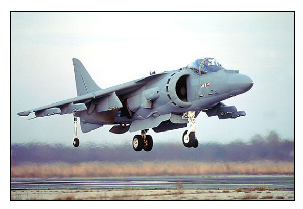
AB-8B Harrier

Pilots are impressed with the radar's look-down/shootdown capability. This characteristic generated a significant FMS market for retrofits into older aircraft.