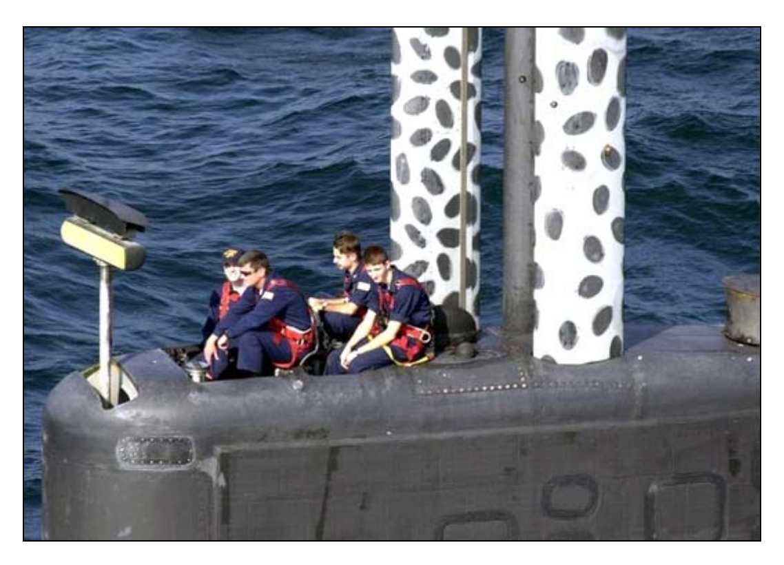
BPS-16(V) radar on SSN-70.