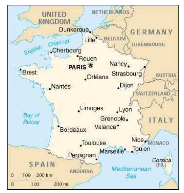
Sagem is developing the French Army Soldier System (FELIN).

Studies are already under way for what can provisionally be called Version 2. Version 2 is expected to be considerably more far-reaching than Version 1. Version 2 is tentatively scheduled to be completed by year-end 2015.