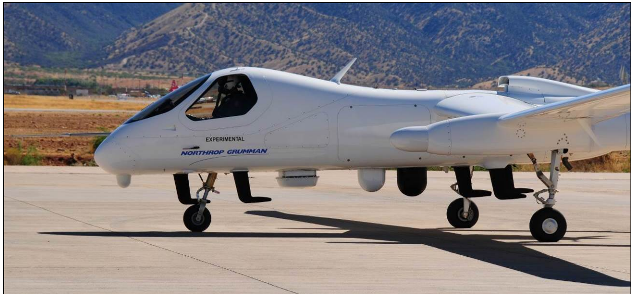
The ZPY-1 STARLite flew on board a Northrop Grumman experimental platform.

The U.S. Army FY13 budget called for the acquisition of only 107 Gray Eagle units. At one time, the U.S. Army intended to procure at least 168, so the final acquisition number could rise yet again. The production forecast was expected to become clearer following the Gray Eagle's FOT&E.