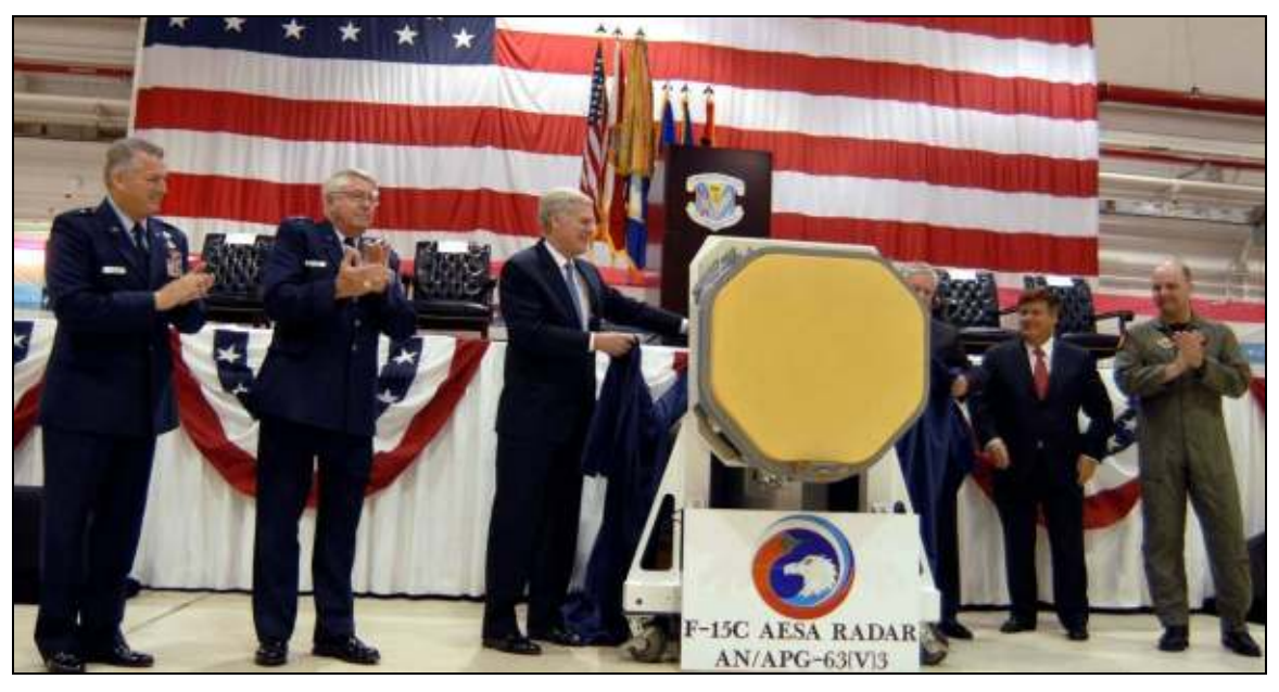
April 2010 Unveiling of the U.S. National Guard's APG-63(V)3 AESA Upgrade