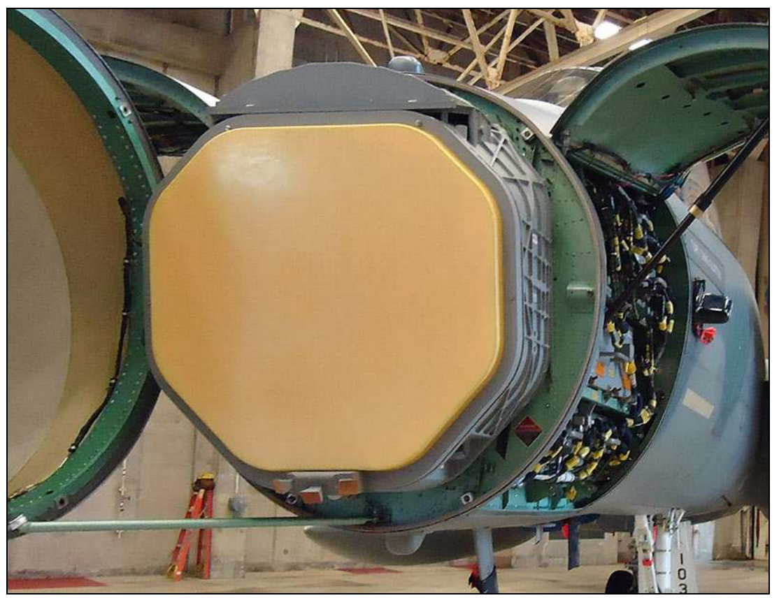
APG-63(V)3 in an F-15C Nosecone

APX-114. Raytheon long-range IFF interrogator system designed for compatibility with APG-63 series