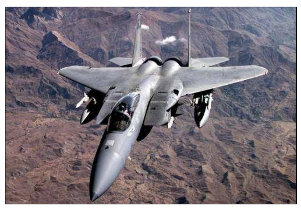
APG-63 Platform: U.S. Air Force F-15C